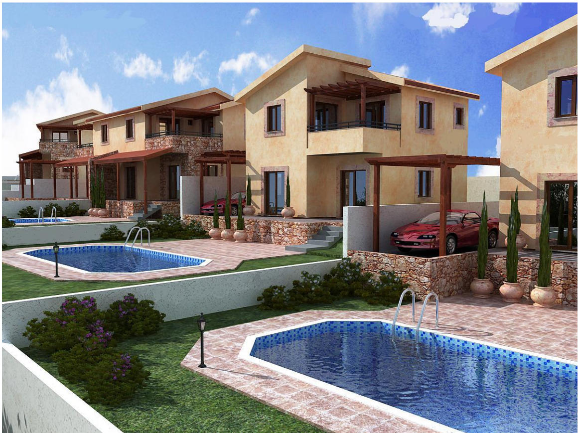
Figure 11. Views of the villas of PANORAMA HILLS