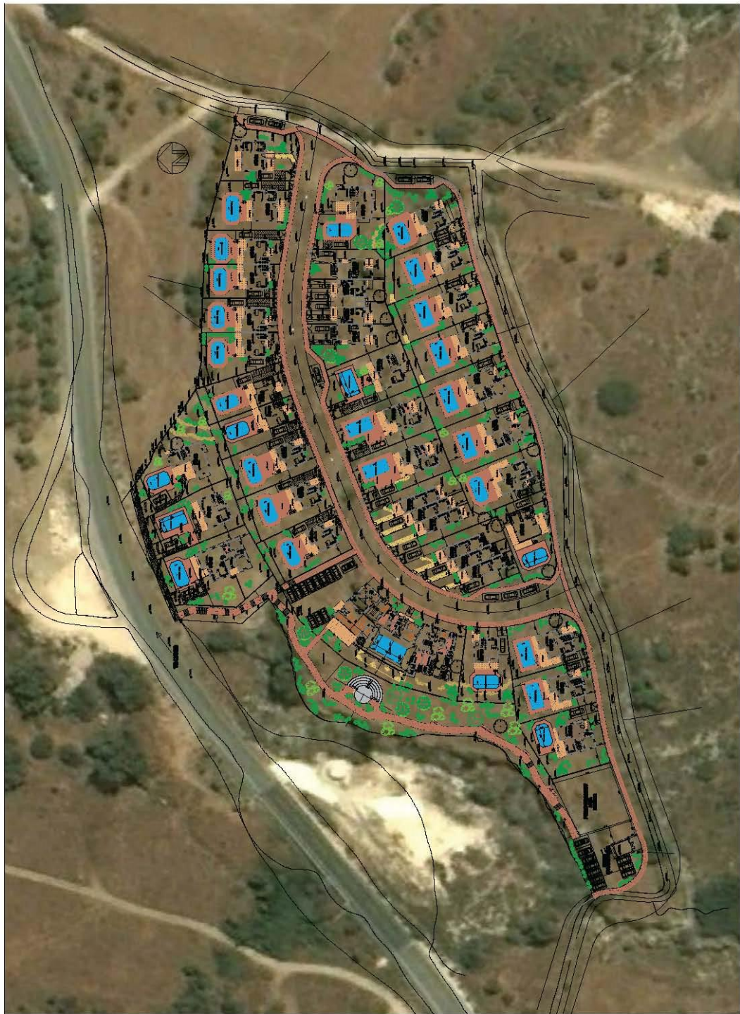
Figure 11. Layout of PANORAMA HILLS